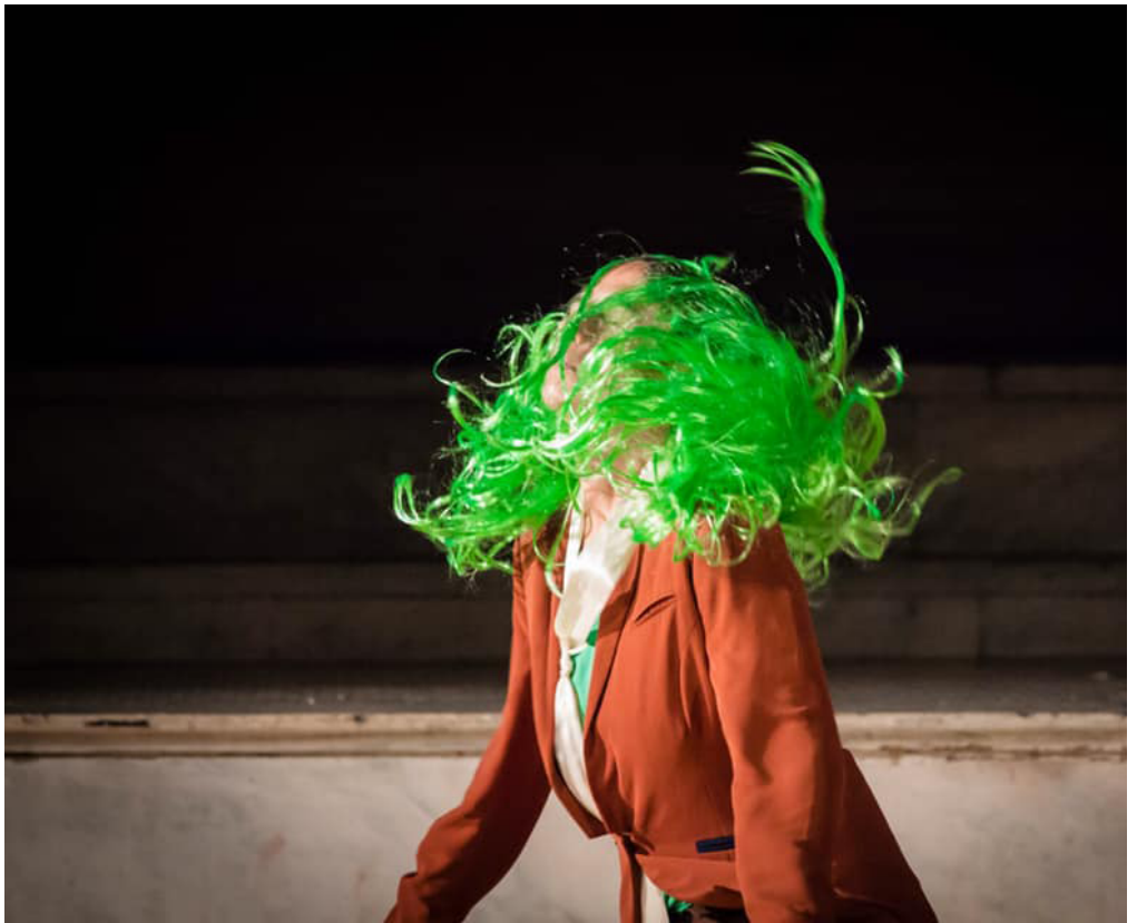
Crossroads Series at Judson Church - Rina Espiritu